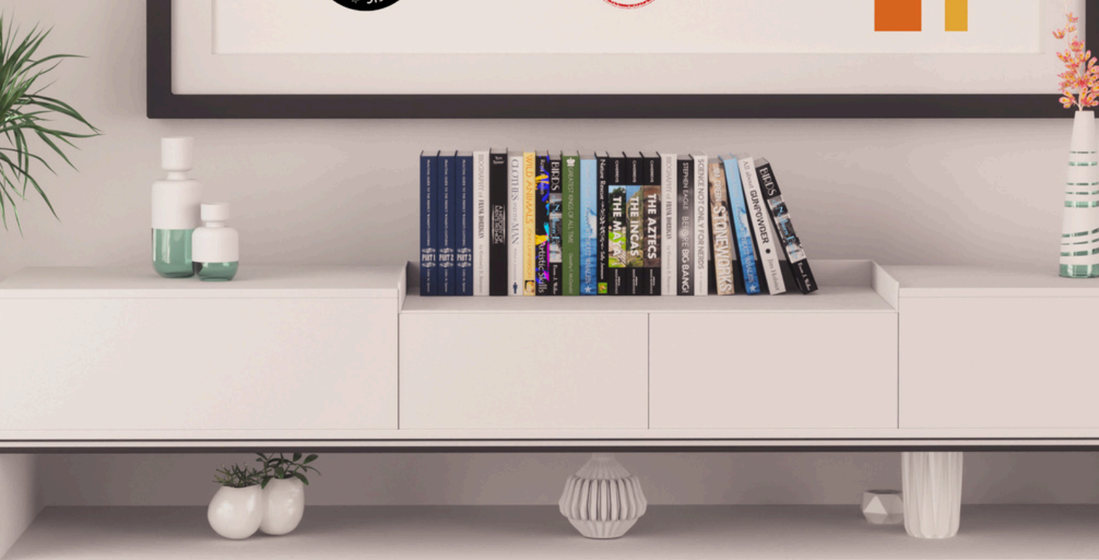
*How to display the certificate after printing (illustration)